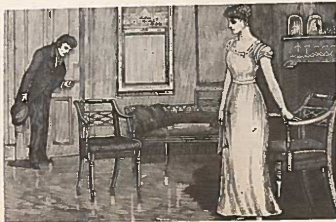
A rejected lover

"Do not introduce po religion, or serious subjects into a conversation when m a call."