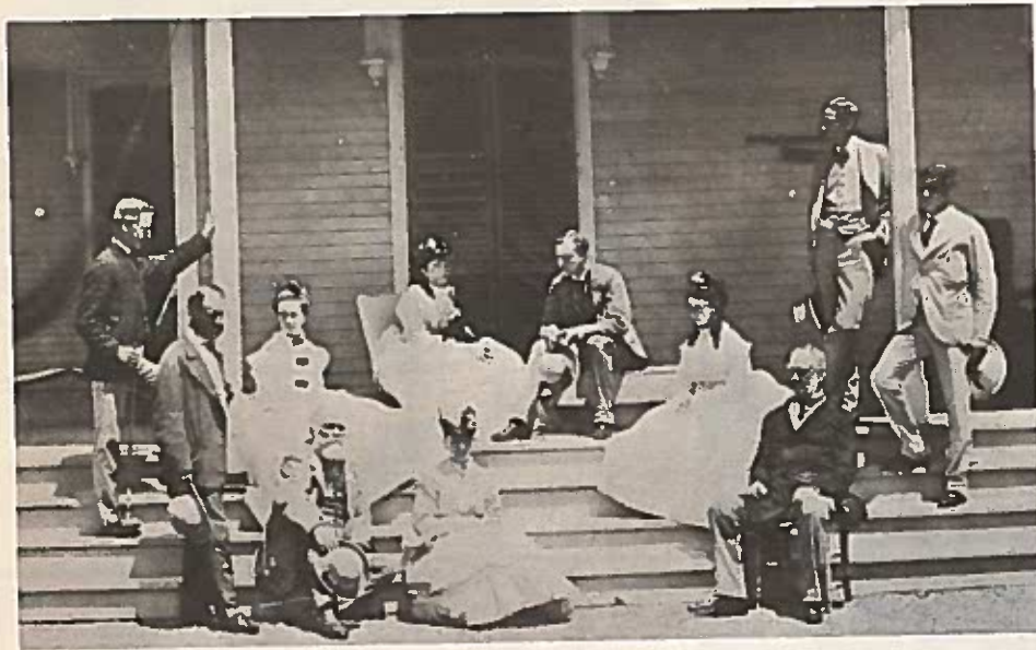
Guests at Belmore